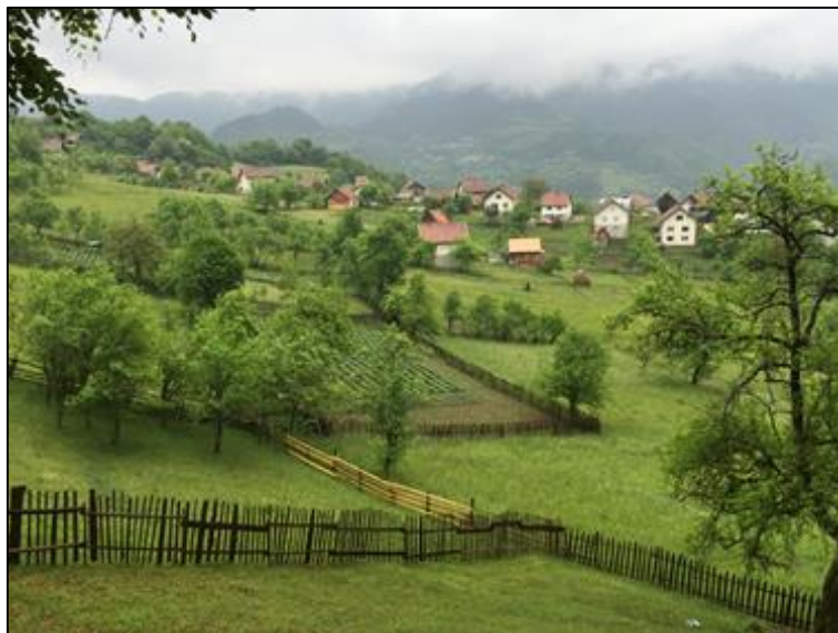
Fig 12: Gardens and orchards right next to the houses