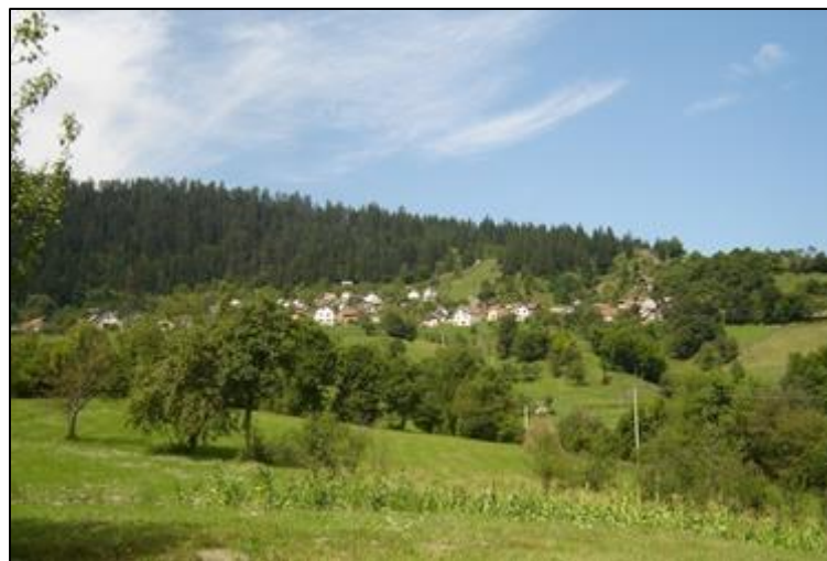
Fig 3: View of the Glavicno village from Voznici