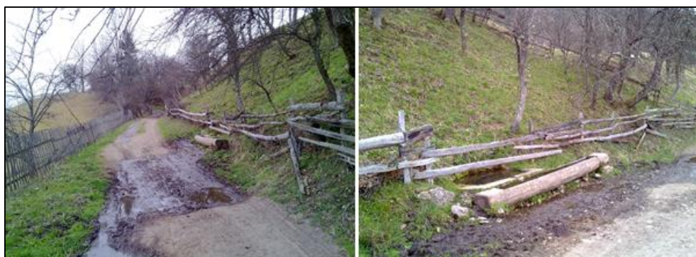
Fig 10: A fountain with a trough for cattle by the road to Voznici and Martinovici