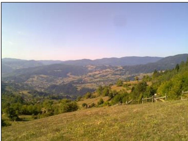
Fig 4: View of Glavično from the locality of Lokva, above the Hadre village