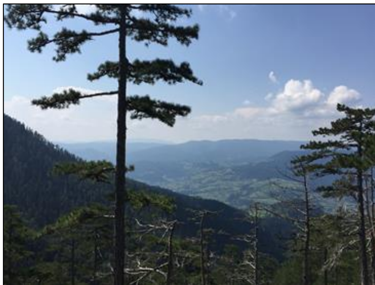
Fig 6: View of Glavicno from Bijeli vrh