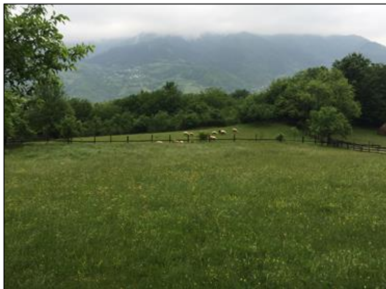
Fig 13: Fields and meadows of the Glavicno village